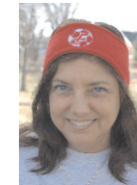
ITEM NO. - FC 1008

Youth small thru xlarge- $22.00 Adult small thru xlarge - $22.00 2x large - $24.00 3x large - $26.00