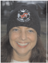
ITEM NO. - FC 1003

Youth small thru xlarge- $12.00 Adult small thru xlarge - $15.00 2x large - $17.00 3x large - $19.00