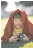
ITEM NO. - FC 1004