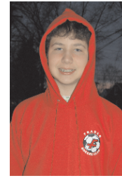
ITEM NO. - FC 1006