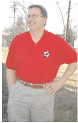
ITEM NO. - FC 1001