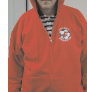
ITEM NO. - FC 1007

Youth small thru xlarge- $18.00 Adult small thru xlarge - $20.00 2x large - $22.00 3x large - $24.00